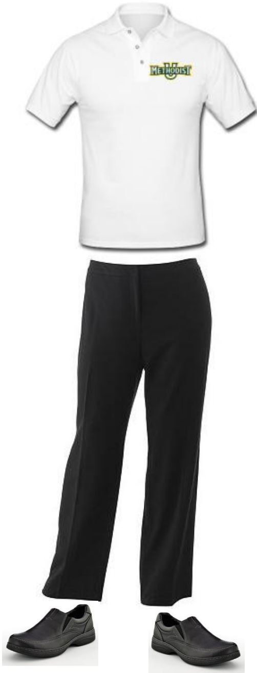
Illustration of Proper Dress for Clinical Observations