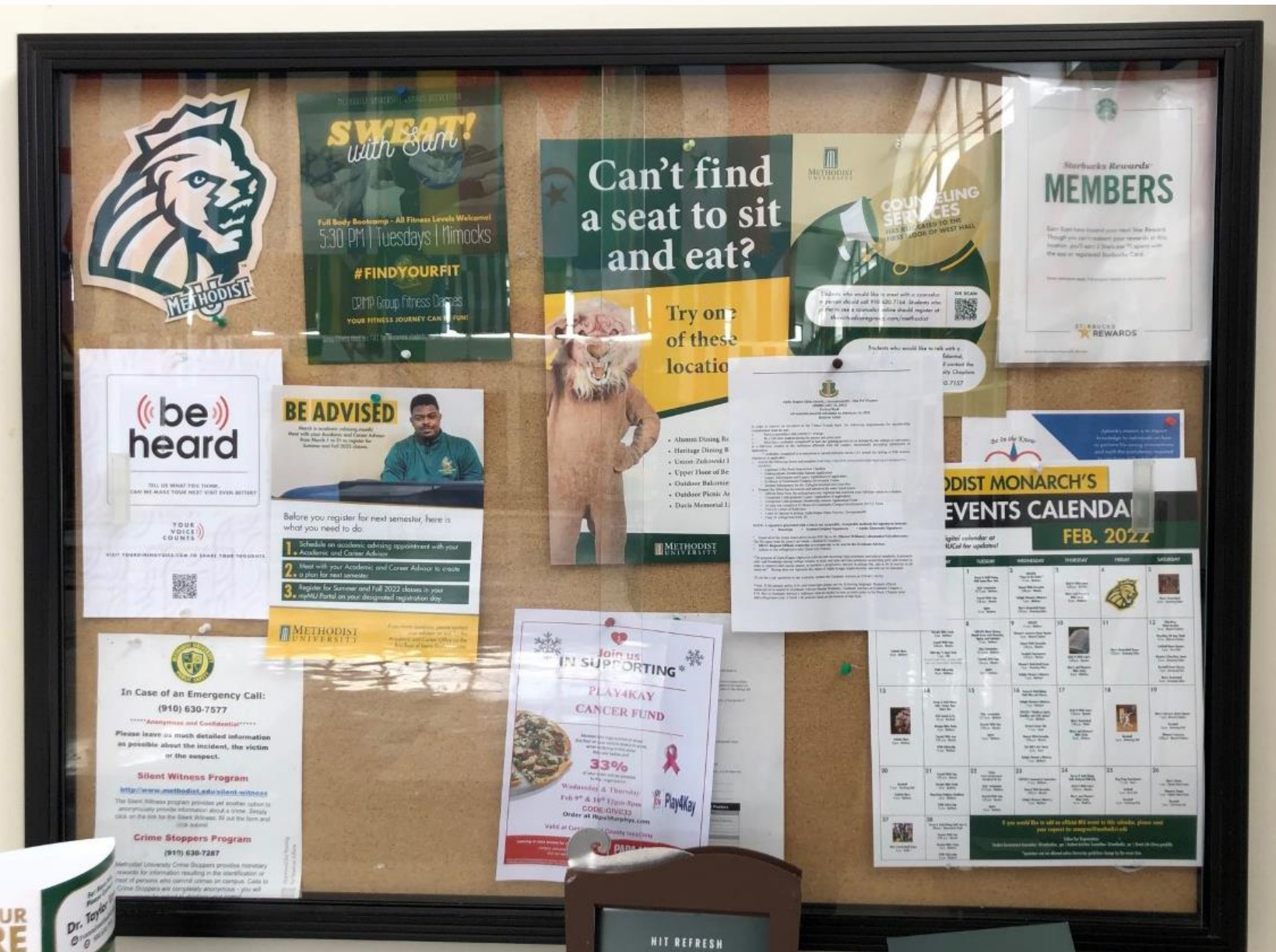
Berns Student Center

Platform Methodist is working to implement